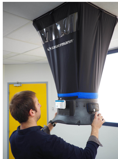
Use of the air flow meter